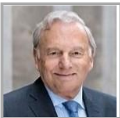
Hans Ronneberger Rentrop & Partner - Germany

We have investigated which tax components the individual countries use to promote or burden the sale of cars. Environmental and climate protection are offset by the great economic importance of the car market for the economy. In many countries, the transition from combustion engines to electric vehicles is being used as an opportunity to impose a higher tax burden on the purchase of a new combustion engine, while promoting the purchase of an electric vehicle through premiums and tax concessions.